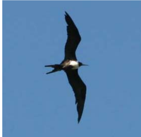
Magnificent Frigatebird. September 25, 2005. Bishop Point Recreation Area.