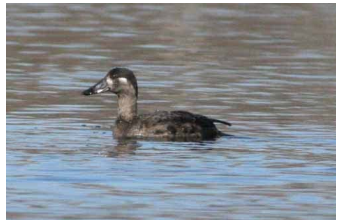
Surf Scoter C. Bickham-Dickson Park, 30 December 2007

Saturday, January 5 and 19, and February 2 and 16, 2008, 8:00-10:00 a.m.