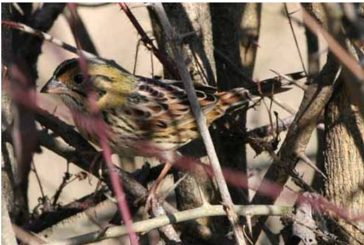
Henslow's Sparrow