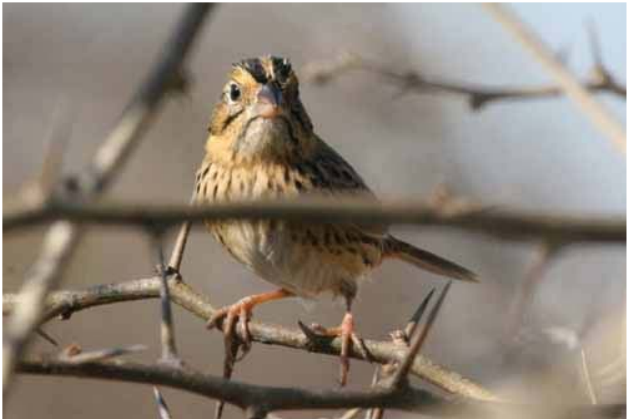
Henslow's Sparrow © (Photo by Jeff Trahan, C. Bickham-Dickson Park, 30 December 2007)