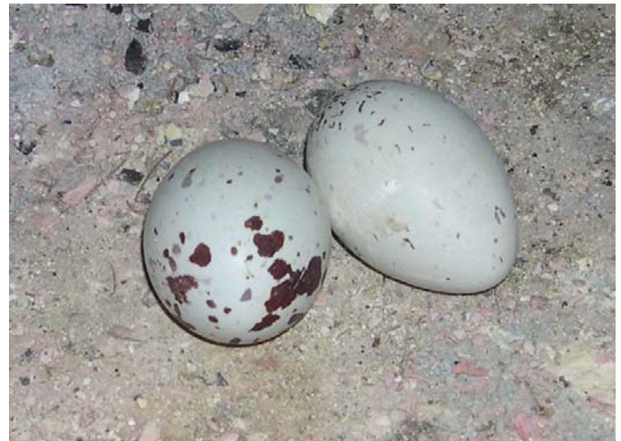
Figure 1. Black Vulture eggs. April 29, 2005.

One afternoon Marilyn and I drove to the home of Don Griffith to see a vulture nest. The “nest” was the floor of a deer stand and belonged to a Black Vulture . Two eggs and one adult were present. The eggs seemed fine and had been moved (by the adult?) about ½ meter from their original position when discovered on April 29 (Figure 1). The adult was photographed at the nest by Betty Griffith on April 29 with a Polaroid camera by just holding it up to the window. I have continued to monitor this nesting and the pictures below (Figures 2 and 3) are of the one hatchling chick and the remaining failed egg. The location is 12651 Johns Gin Road (0.7 mi. S on Johns Gin Road from Springridge-Texas Line Road, Caddo Parish).