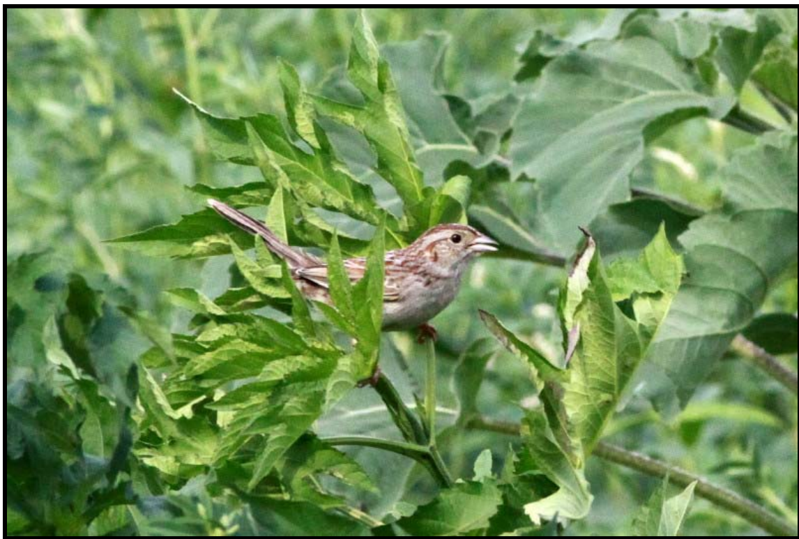
Cassin's Sparrow, May 1, 2011, Cane's Landing, Bossier City, LA.

Cassin's Sparrow is a western species, native to the arid grasslands of south-central U.S. and northern Mexico. It is a small sparrow with plain grayish-brown plumage, but has an interesting and conspicuous territorial display, called skylarking. It flies straight up into the air and floats down on fixed wings while singing. Learn more about Cassin's Sparrow at http://www.allaboutbirds.org/guide/Cassin's_Sparrow/lifehistory